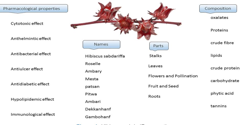
Figure 1. Hibiscus sabdariffa properties.

HS has been found to have biochemical effects on reproductive hormones such as testosterone, luteinizing hormone, and prolactin.<sup>29,30</sup> Improved postprandial vascular function and CVD risk reduction and modified postprandial flow-mediated dilatation (FMD) of the brachial artery were demonstrated after consumption of HS calyces (HSC).<sup>31</sup> According to the World Health Organization (WHO), cancer is the second biggest cause of death after cardiovascular diseases and is responsible for an expected more than 9.5 million deaths in 2018.<sup>32</sup> It has been estimated that approximately 29.5 million people will be diagnosed with cancer by the year 2040.<sup>33</sup> Although the underlying mechanisms remain unclear, HS is a candidate for chemotherapeutic applications due to its phytochemicals, and it is known as an effective