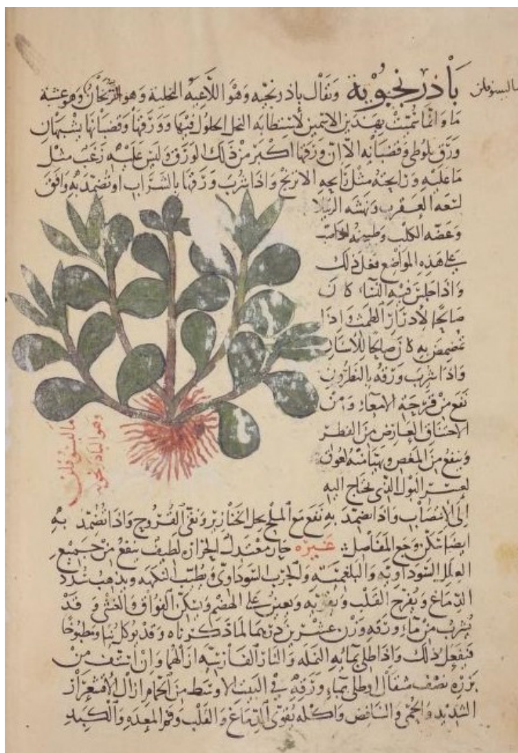
Figure 2. Description and applications of Lemon balm according to “Fi al-Adwiya al-mufrada” by Abu Jaafar Ahmed bin Muhammad bin Said Al-Ghafiqi. Available from: https://archive.org/details/McGillLibrary-osl_al-ghafiqi_MS7508-18872/page/n158/mode/2up .