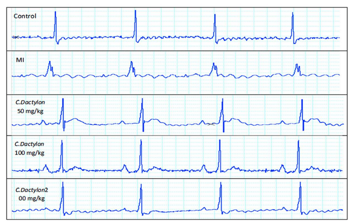
Figure 2. Representative of ECG pattern and changes (recorded from limb lead II) in control, MI and cyno treated rats. MI: Isoproterenolinduced myocardial Infarction; Cyno: Cynodon dactylon. (n = 6).

Peripheral neutrophil percentage, an indicator of systemic inflammation, was significantly increased from 23\pm3\% in the control group to 45\pm7\% in the MI group (p<0.01). Administration of hydroalcoholic extract of C. dactylon with doses of 50, 100 and 200 mg/kg significantly reduced the neutrophil percentage to 29\pm1\% , 24\pm3\% and 16\pm3\% respectively (p<0.01,p<0.01andp<0.001) (Figure 3).