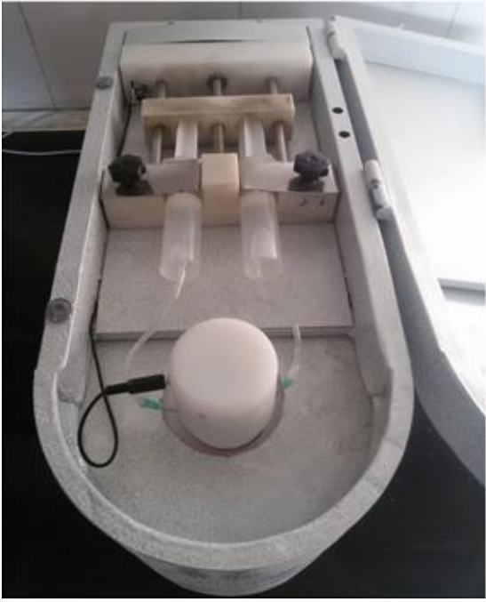
Figure 1. A photograph of the setup.